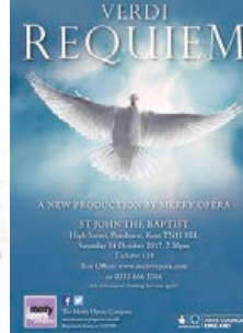
Merry Opera Company