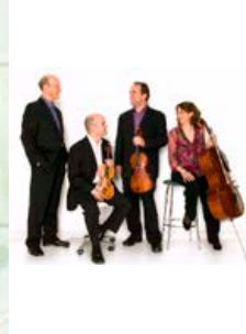
The Schubert Ensemble