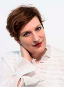
Dame Sarah Connolly